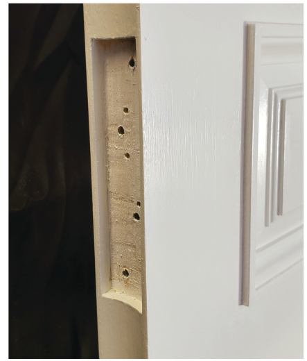
Door edge cut to 19/16" radius ready for hinge