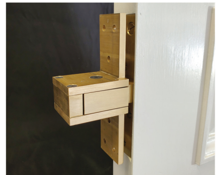
Hinge set into door