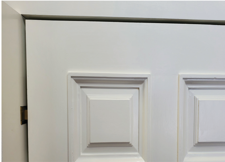
View w/door closed in jamb position