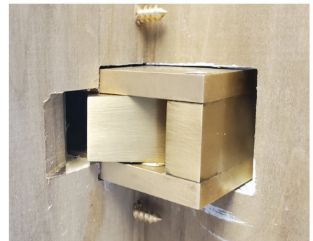
From inside jamb of hinge cut out