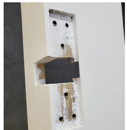
View of jamb face w/mortise cut out